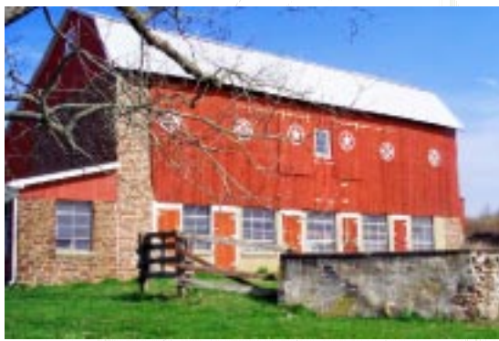
Historic barn circa 1875, Bedminster Township, Bucks County