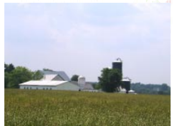
Farmscape in Cabin Run Historic District, Bedminster Township, Bucks County

Reflecting the historic towns, rolling hills and green lands of its past, today this important arterial roadway is under significant pressure from advancing suburbanization.