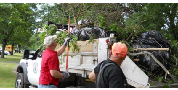
Bristol Borough Public Works staff always help out.