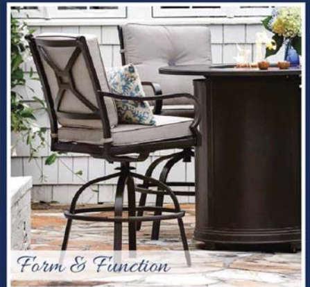
Form & Function