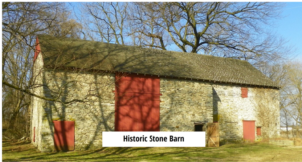
Historic Stone Barn